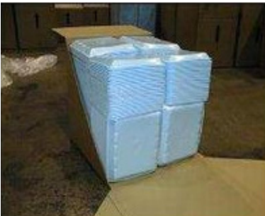
Cartoned, Expanded Plastic