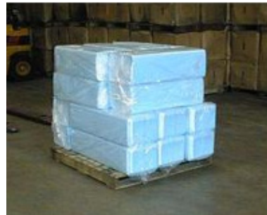
Exposed, Expanded Plastic